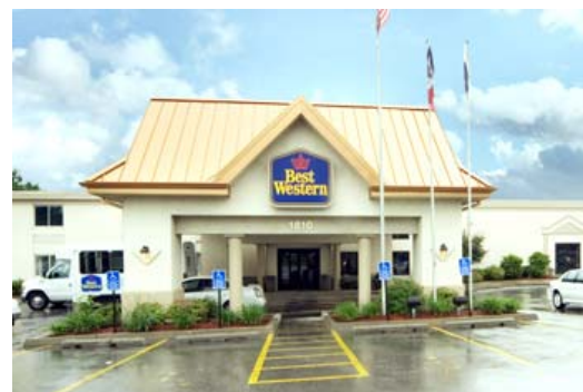
The Best Western Des Moines Airport Hotel

Located on-site is a bar/lounge style restaurant that serves American food for lunch and dinner. A continental breakfast is available for hotel guests as well.