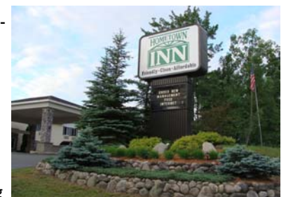
The new sign at the Hometown Inn in Indian River, MI

The fifty-room limited-service hotel is located in picturesque northern Michigan.