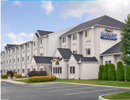
The Baymont Inn & Suites of Northwood, Ohio

A recent guest at the Baymont Inn & Suites left a letter at the front desk expressing her gratitude of the staff during her recent stay at the property. Job well done Baymont team!