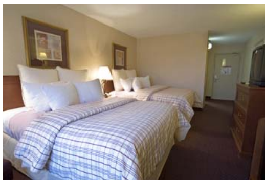
One of the 140 guestrooms at the Best Western Des Moines Airport Hotel

The Best Western Des Moines Airport is a full-service hotel. Each of the spacious guestrooms has free wireless internet access and local calls. A business center, indoor heated pool, hot tub, and weight lifting equipment are some of the additional amenities available.